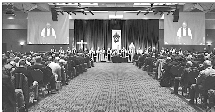
Last month about 800 men, including hundreds of Knights, attended the Oklahoma Catholic Men's Conference in Norman. The annual event gives men a chance to become better husbands and fathers and to deepen their faith in Catholicism.