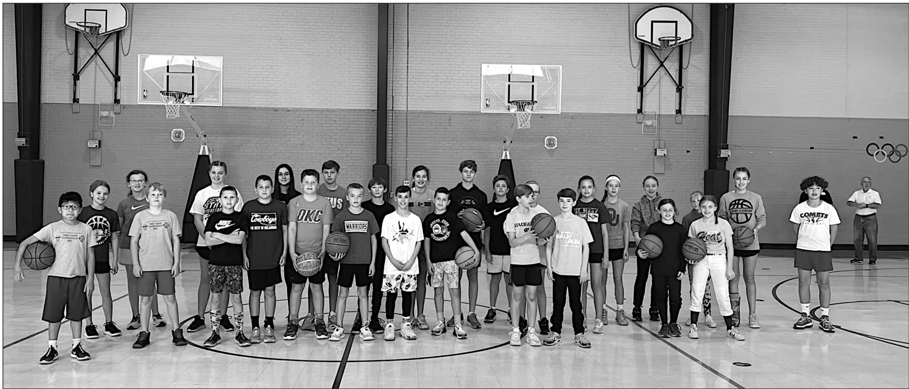
Congratulations to OKC Council 8204 for its magnificent job in hosting the state free throw contest. The event drew many participants and run smoothly.